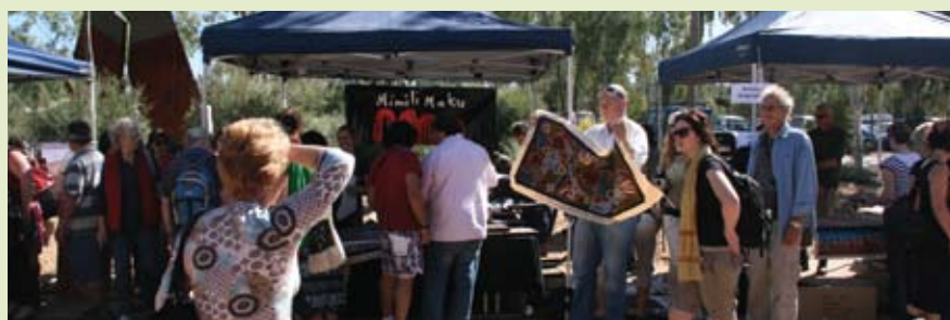
Shoppers swarm around the Mimili Maku market stall in Alice Springs

Similarly, the Mimili art centre has recently registered with ORIC and is preparing to participate in the annual general meeting training and conduct its first AGM. Artworks from Mimili Maku Arts are selling like hot cakes, with a major exhibition at Desert Mob, in Alice Springs taking place in early September.